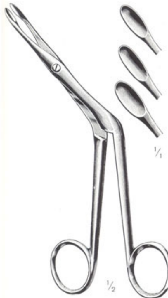
Heymann 18 cm / 7"