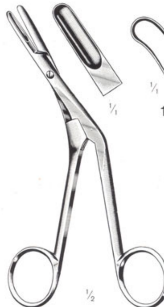
Craig -213-18 18 cm / 7"