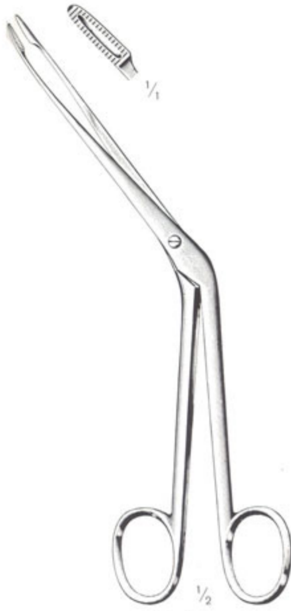
Hartmann 1-145-20 20 cm / 8"