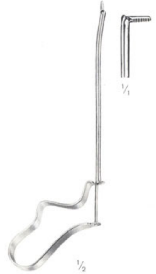
Quire 1-180-12 12 cm / 4 3/4"