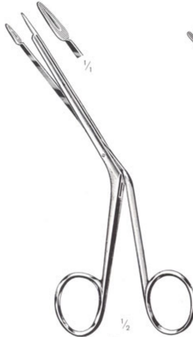
Littauer 1-151-18 18 cm / 7"