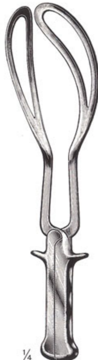
¼ De Lee 1-165-36 = 36 cm/14"