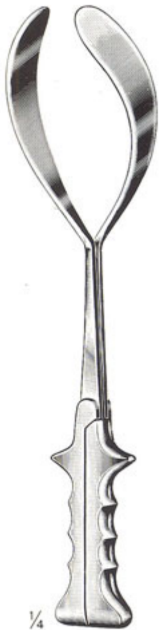
¼ Mc Lean-Tucker 1-187-39 39 cm/15½"