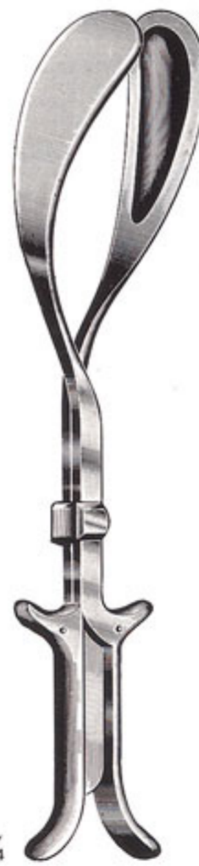
¼ Luikart 1-201-40 40 cm/15¾"

Traction Handle for obstetrical forceps 1-195-41– 1-201-40