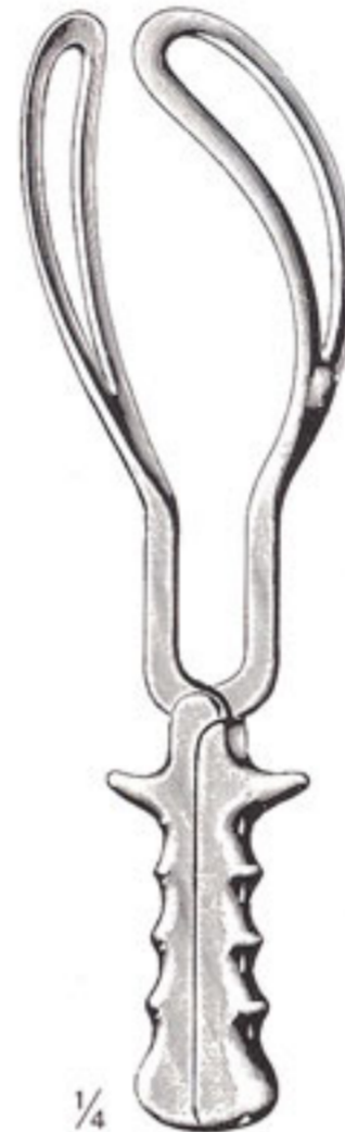
¼ Simpson-Braun 1-149-36 = 36 cm/14"