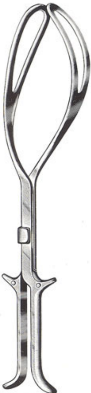
¼ Kielland 1-195-41 41 cm/16"