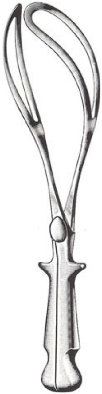
Naegele 1-141-36 = 36 cm/14" 1-141-40 = 40 cm/16"