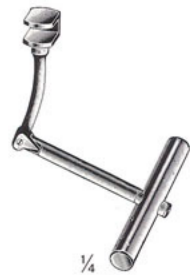
¼ Luikart-Bill 1-211-21 21 cm/8¼"

Traction Handle for obstetrical forceps 1-195-41– 1-201-40