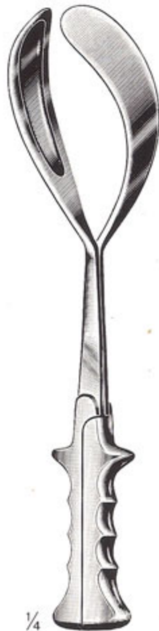
¼ Mc Lean-Luikart 1-189-39 39 cm/15½"

Traction Handle to be used with all obstetrical forceps with standard type handle