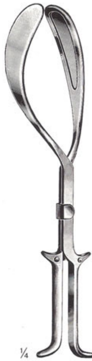
¼ Kielland-Luikart 1-197-40 40 cm/15¾"