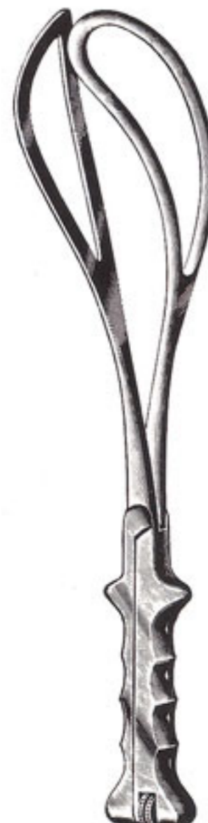
Elliot 1-177-32 = 32 cm/12½" 1-177-38 = 38 cm/15"