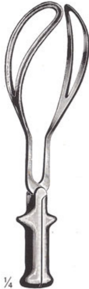
¼ Simpson 1-145-30 30 cm/12"