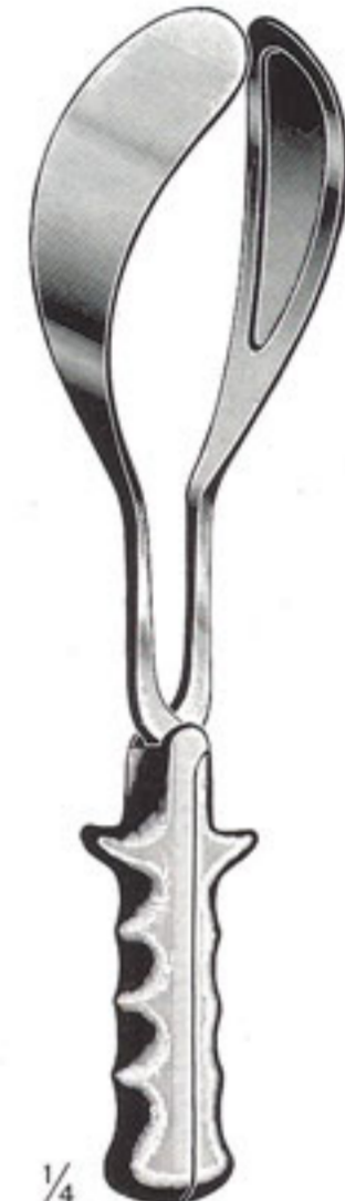
¼ Simpson-Luikart 1-155-36 36 cm/14"