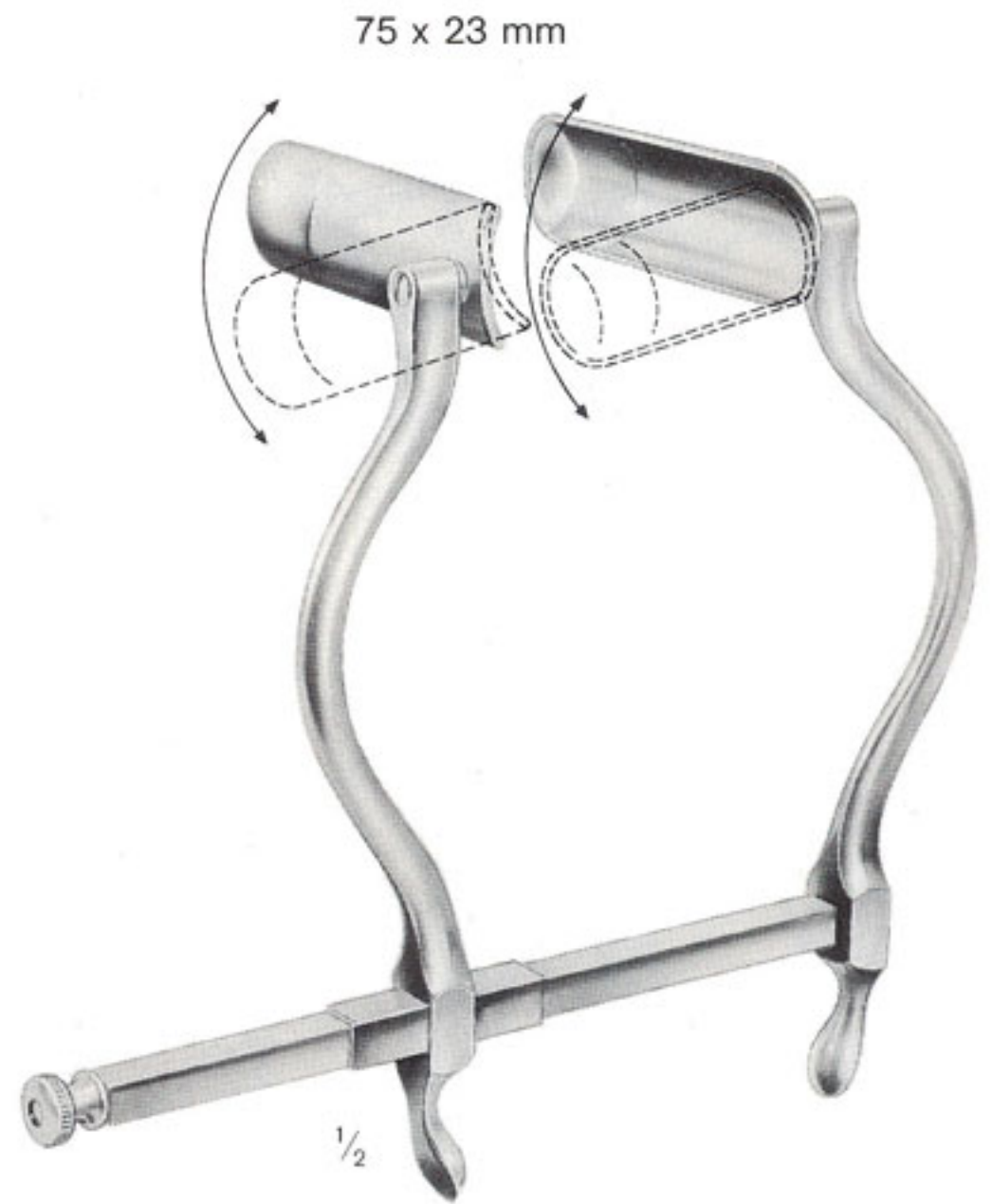
Cook 1-631-19 19,0 cm/7½"