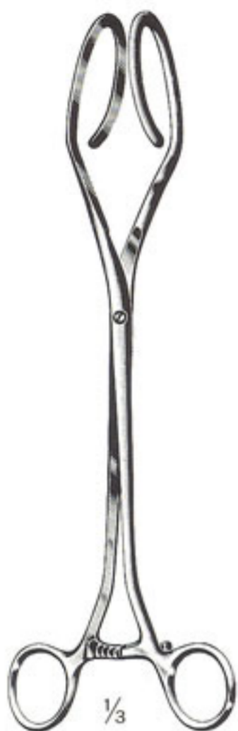
Dartigues 1-773-27 27 cm/10 1/2"