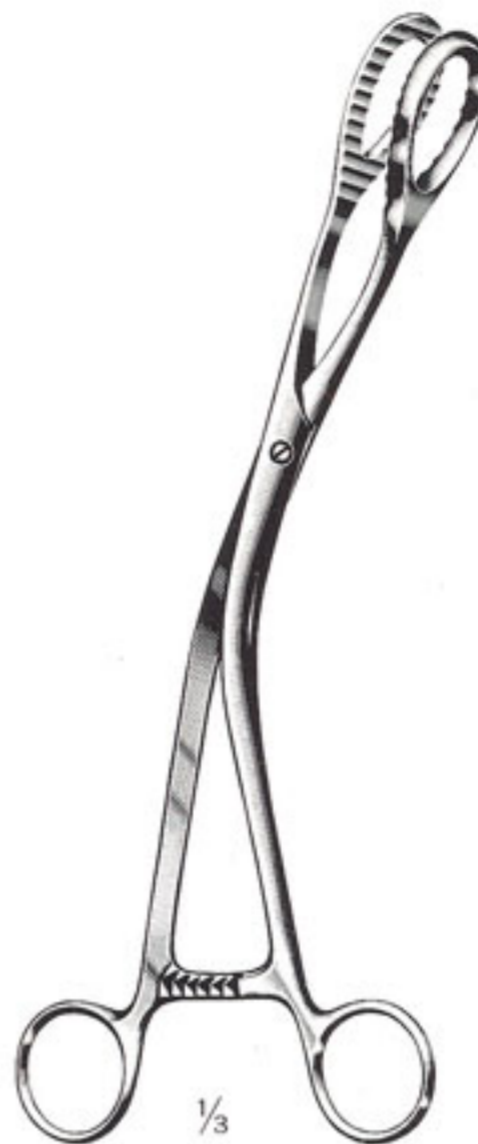
Pruesmann 1-783-27 27,5 cm/10 3/4"