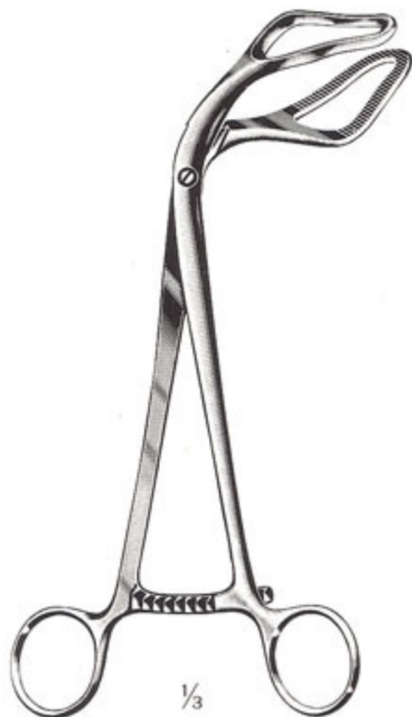
Somer 1-779-23 23 cm/9"